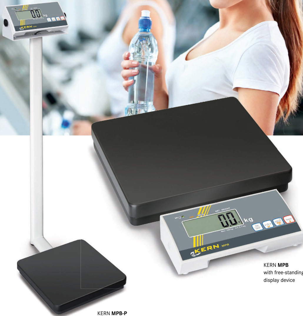
KERN MPB-P with stand